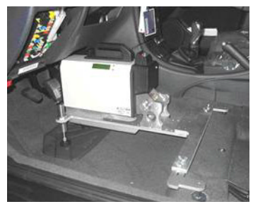
Force and way measurement of the brake pedal