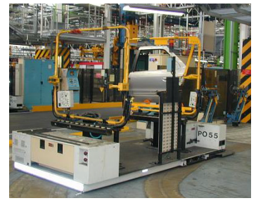
Automated guided vehicle