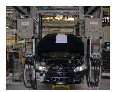
Tightness testing of air conditioning system, cooling liquid and brake fluid