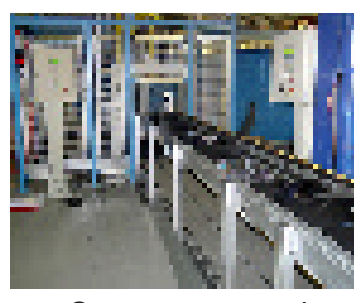
Conveyance and assembly of pieces