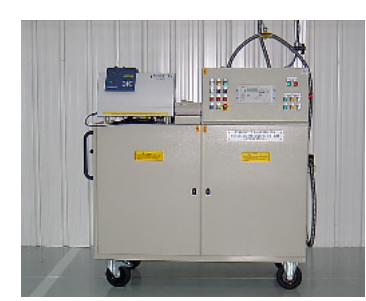
Mobile filling system