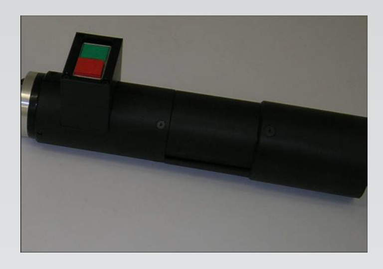
View of the main body with the control buttons